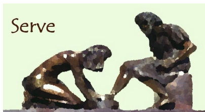
Click the image to learn more on how to get involved in the community

to everyone who donated food, contributed to the Make-a-Difference fund, packed or delivered Snackpacks this season. With your donations we were able to provide food for 6 families, with 19 children and 34 people overall at Merriam Park Elementary. Harvesters just let us know late this week that they will be starting back up this Wednesday with deliveries of their packages of food which we will deliver to the school each week for the children's weekend meals.